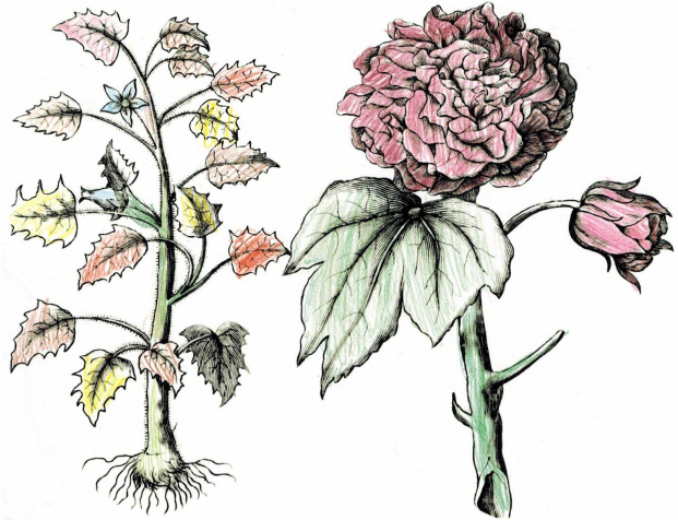
By Travis Alig